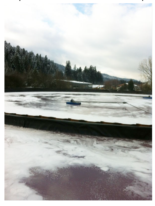
Buffer tank in a textile industry (5 HYDROPULSE 4kW)