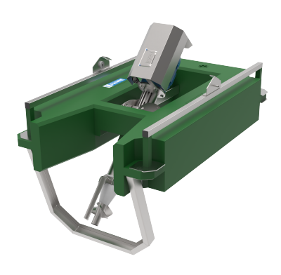
Representation of HYDROPULSE